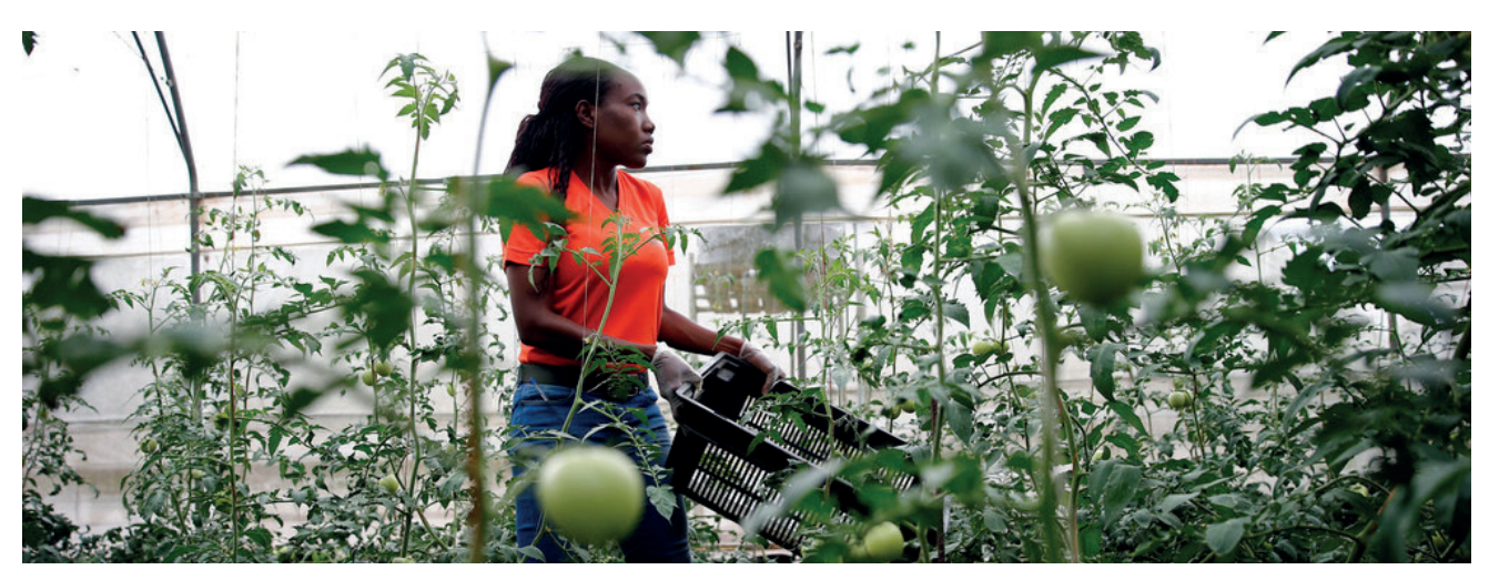
sourced finance for working capital. Furthermore, the adoption of Sustainable Development Goals (SDGs) by Kenya and other countries bolsters the need for statistics on Women's Economic Empowerment (WEE) in response to SDG Goal number 5.

In addition to the general challenges that MSMEs face, women-owned MSMEs are further disproportionately impacted by gender, social and cultural norms. Women-owned businesses are smaller in size and enjoy lower profits and lower take-home pay in comparison to men's enterprises (International Finance Corporation, 2011). Further, the COVID-19 pandemic has had significant gender impacts, such as increased cases of Gender-Based Violence (GBV) and the merging of the private and public spheres thus increasing the burden of unpaid care and domestic work which exacerbate challenges that women-owned MSMEs usually face (Mbote and Meroka- Mutua 2020). The CGS, therefore, as a part of the Presidential economic stimulus package to alleviate the impact of the COVID-19 pandemic on MSMEs is a timely and crucial tool to aid MSMEs in accessing credit facilities for their business needs. Understanding the extent to which women-owned MSMEs are accessing and benefitting from credit generally and from the CGS in particular, as well as documenting their experiences and behavior in credit markets, will inform policy initiatives on how best to help women-owned enterprises access guaranteed credit.